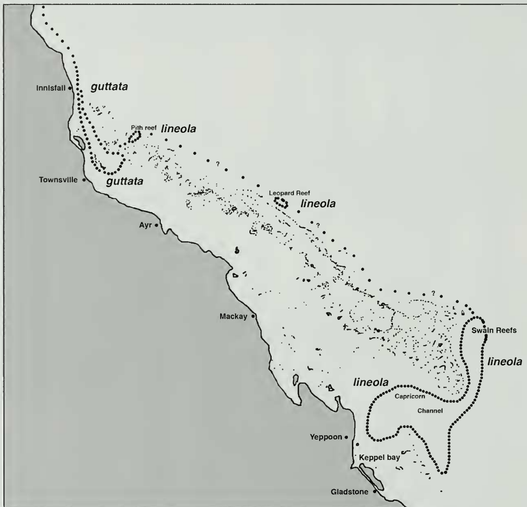
Map 1. Distribution of Amoria lineola n.sp. and A. guttata McMichael, 1964

Some specimens of A. lineola bear many spots which could appear dominant but they are always broader and coarser than the ones of A. guttata , and the presence of other specific characters confirms the identification (Figs 32-35). The shape of A. guttata is not well fixed, especially in the northern portion of its range. Some shells have a very expanded last whorl, and somewhat resemble A. lineola . The distinction may be subtle and needs the presence of the other discriminating characters (Figs 54-55).